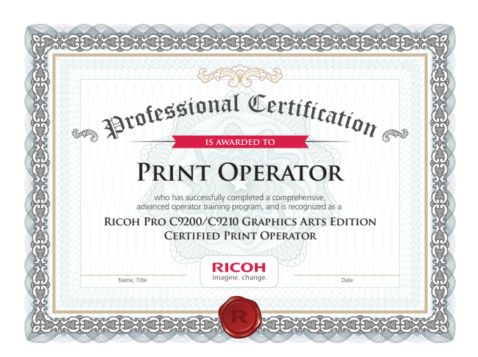
Upon completion of the training program, your team members will become Certified Print Operators for the Ricoh system they were trained on.