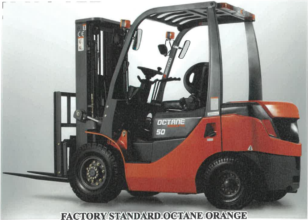
FACTORY STANDARD OCTANE ORANGE