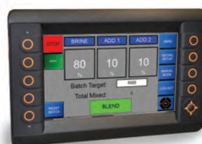
7" LCD Control Pad