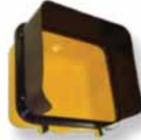
16" Tunnel visor (sold separately)