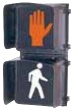
12" 2-section with tunnel visors