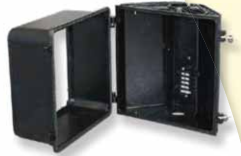
12 inch housing shown in black