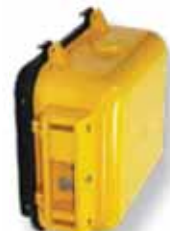
16" Clamshell mount (sold separately)

*Dimensions are approximate and vary based on material used