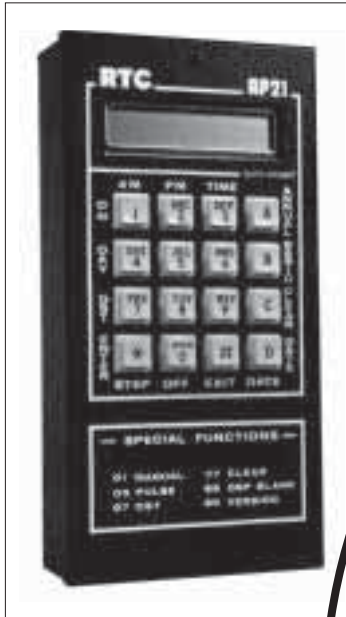
AP21 AC/DC Powered

WVDOH Solicitation CRFQ 0803 DOT1700000094 Item #44 Qty. 5