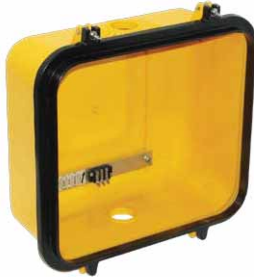
16 inch housing shown in Federal yellow