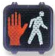
16" with Vantage Visor