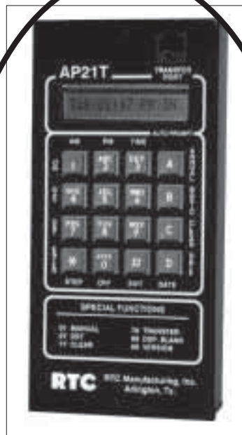
AP21T AC/DC Powered with Program Transfer