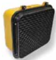
16" Vantage Visor (sold separately)