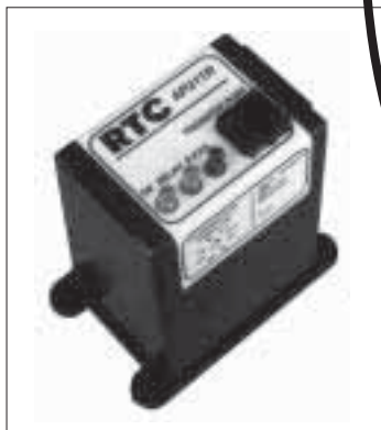
AP21TR AP21TRDC Compact Size: 2" x 2 1/2" x 4"