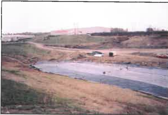
Construction of the HDPE geomembrane over Cell F-3b.

POTESTA provided construction certifications for each geosynthetic layer and prepared a final summary of construction report for submittal to the West Virginia Department of Environmental Protection.