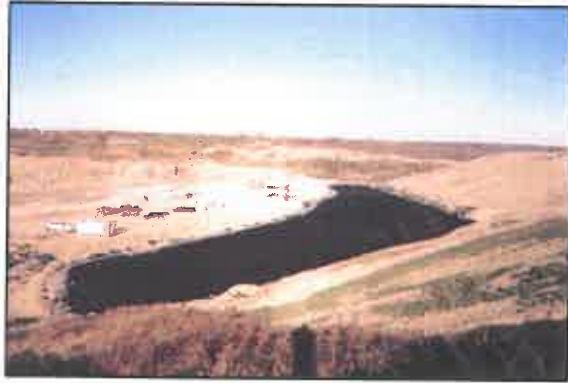
Completed geosynthetic liner system of Cell F-3b ready to receive the protective soil cover.

The liner system consisted of five geosynthetic layers placed over a prepared soil subgrade. POTESTA provided a full-time construction monitor to observe placement and witness quality control testing for the construction of the new cell. Cell F-3b was approximately 1.8 acres. POTESTA reviewed quality assurance/quality control test results provided by the manufacturer, observed and documented the arrangement of panels for the geosynthetic materials, observed placement and tying of two HDPE drainage net layers for leak detection and leachate collection, observed and documented daily trial seaming and testing for 80-mil HDPE geomembrane (primary liner) and 60-mil HDPE geomembrane (secondary liner), and observed and documented destructive and nondestructive seam testing of HDPE geomembrane panels.