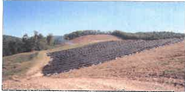
Cell 1-B slope covered with geosynthetic cap prior to placing the final soil cover layer.

Potesta & Associates, Inc. (POTESTA) was retained by the Pocahontas County Solid Waste Authority (PCSWA) to prepare construction documents and provide construction monitoring for closure of an approximate 2-acre municipal solid waste cell at the PCSWA's landfill near Dunmore, West Virginia. To complete this project, POTESTA designed the closure plan for Cell 1-B and prepared construction documents (i.e., drawings and specifications) including the following closure items.