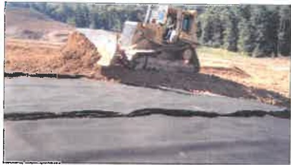
A bulldozer was used to place the 2-foot thick final soil cover layer working from the bottom of the slope to the top.

Construction was completed with POTESTA providing construction monitoring and a certification of construction.