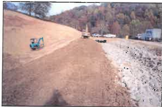
The emergency spillway from the sediment pond drains to a riprap-lined channel and through a box culvert.