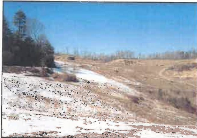
Portions of the landfill were steeply sloped which presented a challenge in designing the geosynthetic cap system.

Potesta & Associates, Inc. (POTESTA) was retained by the West Virginia Department of Environmental Protection (WVDEP) to complete a site characterization for the Fleming Sanitary Landfill. The site characterization included surveying, subsurface investigation including auger and rock core borings, leachate and surface water sampling, groundwater user survey including sampling of water wells, review of historical records, site reconnaissance, assessment of the site's compliance with the Solid Waste Management Rules, and development of a conceptual closure plan.