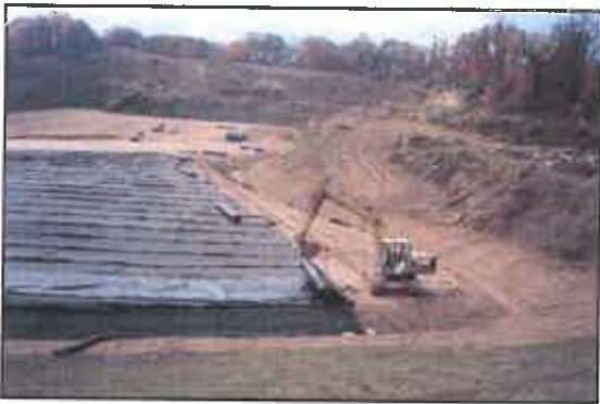
The project included construction of 19 acres of a geosynthetic cap system.

The project also included construction of a new sediment pond, glass-lined bolted steel leachate storage tanks, flow metering station, access roads, drainage channels and culverts, and leachate collection underdrains.