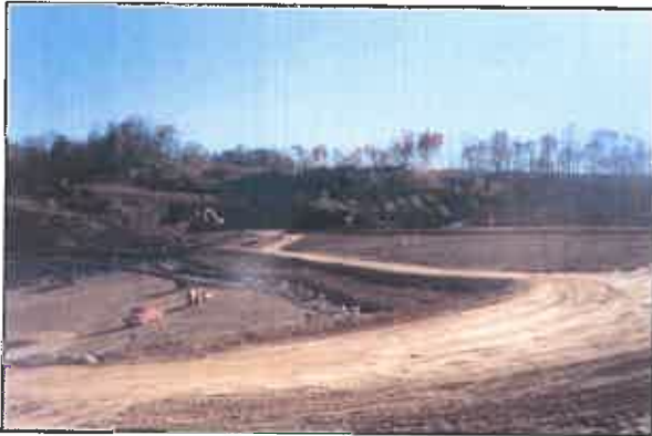
Construction of the cap system was completed in phases. A buttress was constructed over the face of the landfill to flatten slopes to 4 horizontal to 1 vertical to improve stability of the cap.

West Virginia Department of Environmental Protection Landfill Closure Assistance Program Pocatalico, West Virginia