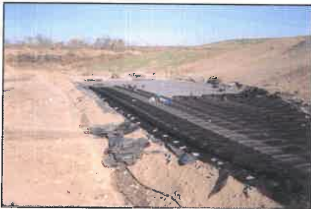
HDPE drainage net was installed as the leak detection layer above the 60-mil HDPE geomembrane.

POTESTA provided construction certifications for each geosynthetic layer and prepared a final summary of construction report for submittal to the West Virginia Department of Environmental Protection.