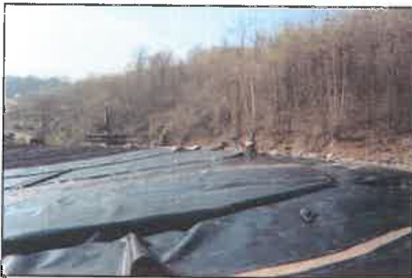
HDPE geomembrane was covered with HDPE drainage net to serve as the leak detection and leachate collection zones.

POTESTA provided construction certifications for each geosynthetic layer and prepared a final summary of construction report for submittal to the West Virginia Department of Environmental Protection.