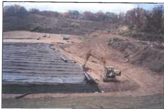
The project included construction of a 19-acre geosynthetic cap system.

POTESTA completed permit applications to allow construction of the project to proceed.