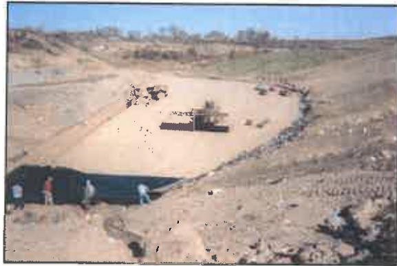
Construction of the 60-mil HDPE geomembrane over the prepared soil subgrade and excavation of perimeter anchor trenches.

The liner system consisted of five geosynthetic layers placed over a prepared soil subgrade. POTESTA provided a full-time construction monitor to observe placement and witness quality control testing for the construction of the new cell. Cell F-3a was approximately 2.5 acres. POTESTA reviewed quality assurance/quality control test results provided by the manufacturer, observed and documented the arrangement of panels for the geosynthetic materials, observed placement and tying of two HDPE drainage net layers for leak detection and leachate collection, observed and documented daily trial seaming and testing for 80-mil HDPE geomembrane (primary liner) and 60-mil HDPE geomembrane (secondary liner), and observed and documented destructive and nondestructive seam testing of HDPE geomembrane panels.