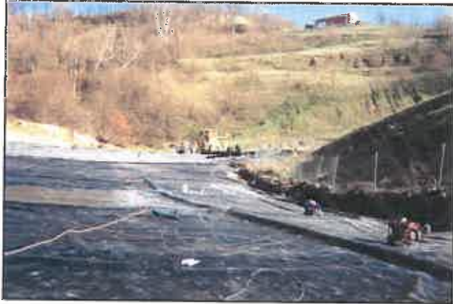
Placement and seaming of 80 and 60 mil HDPE geomembrane was included in the new cell.

The liner system consisted of five geosynthetic layers placed over a prepared soil subgrade. POTESTA provided a full-time construction monitor to observe placement and witness quality control testing for the construction of the new cell. Cell 5a was approximately 0.6 acre. POTESTA reviewed quality assurance/quality control test results provided by the manufacturer, observed and documented the arrangement of panels for the geosynthetic materials, observed placement and tying of two HDPE drainage net layers for leak detection and leachate collection, observed and documented daily trial seaming and testing for 80-mil HDPE geomembrane (primary liner) and 60-mil HDPE geomembrane (secondary liner), and observed and documented destructive and nondestructive seam testing of HDPE geomembrane panels.