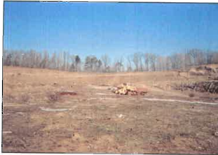
Prior to capping, the landfill area was poorly vegetated and experienced much erosion.

collection underdrains, proposed 200,000-gallon leachate storage tank, access roads, final cap and cover, and a sewer line to convey leachate to the Guthrie Public Service District wastewater treatment system.