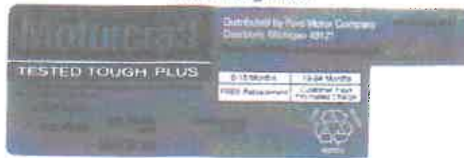
Tested Tough Plus