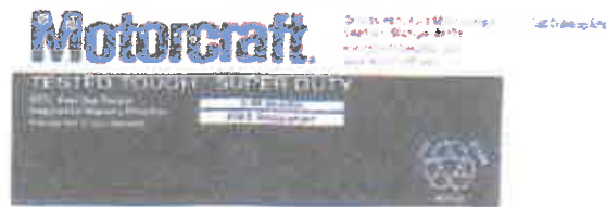
Tested Tough Super Duty