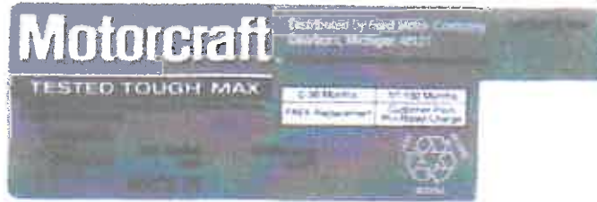
Tested Tough MAX