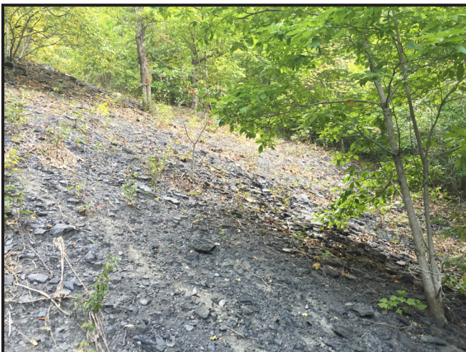
Steep Exposed Refuse Site