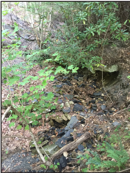
Drainage Channel Erosion

Assist the WVDEP with requests for information, engineering during construction, and/or progress meetings as required or requested.