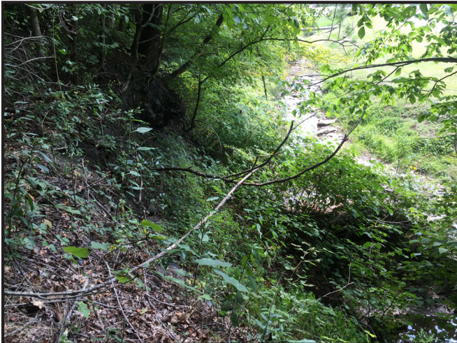
Refuse on Stream Bank