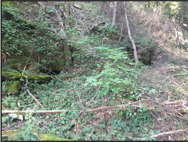
Multiple Open Portal