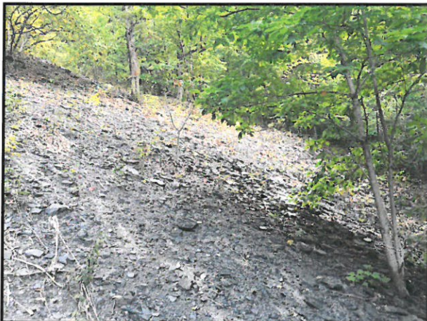
Steep Exposed Refuse Site