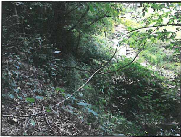
Refuse on Stream Bank