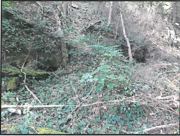
Multiple Open Portal