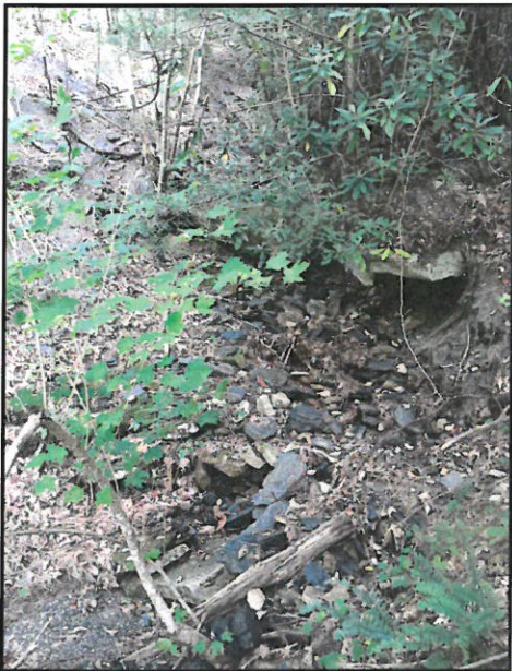
Drainage Channel Erosion

Assist the WVDEP with requests for information, engineering during construction, and/or progress meetings as required or requested.