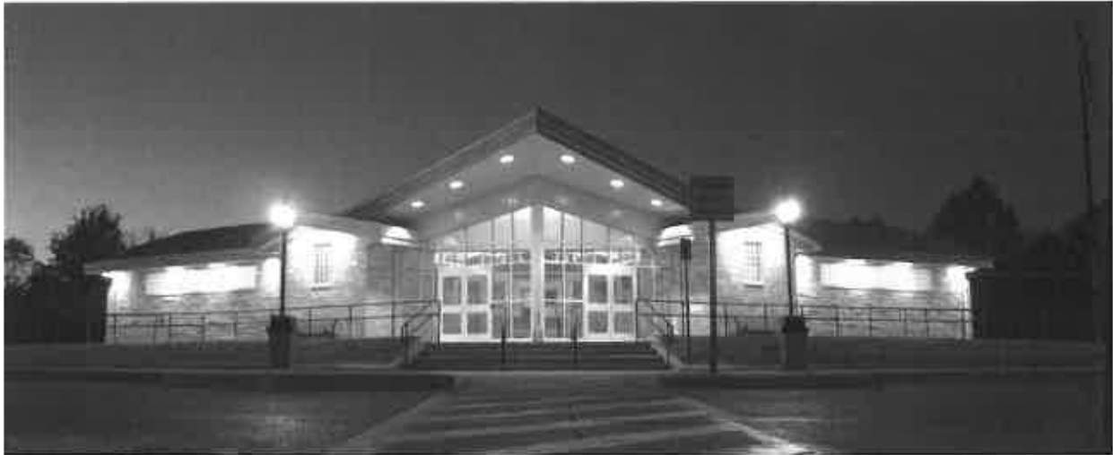
American Institute of Architects, Merit Award, 2009