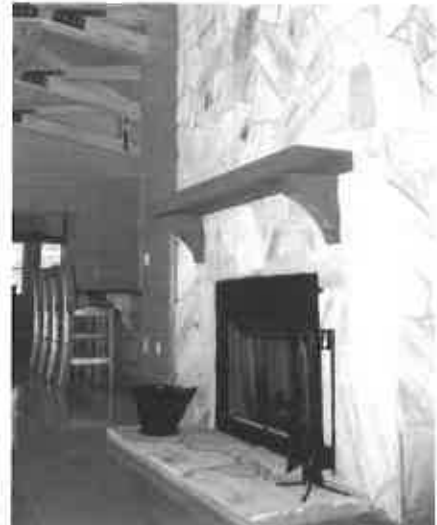
WV Division of Natural Resources Beech Fork State Park Cabins 324 Fourth Avenue South Charleston, West Virginia

Chapman Technical Group designed $4.5 million worth of improvements at the state park near Barboursville including a 50-meter swimming pool, bathhouse, six modern cabins, and campground upgrades. The cabins provide the warmth of natural materials such as wood and stone, yet are fully equipped with modern conveniences including air conditioning and microwaves.