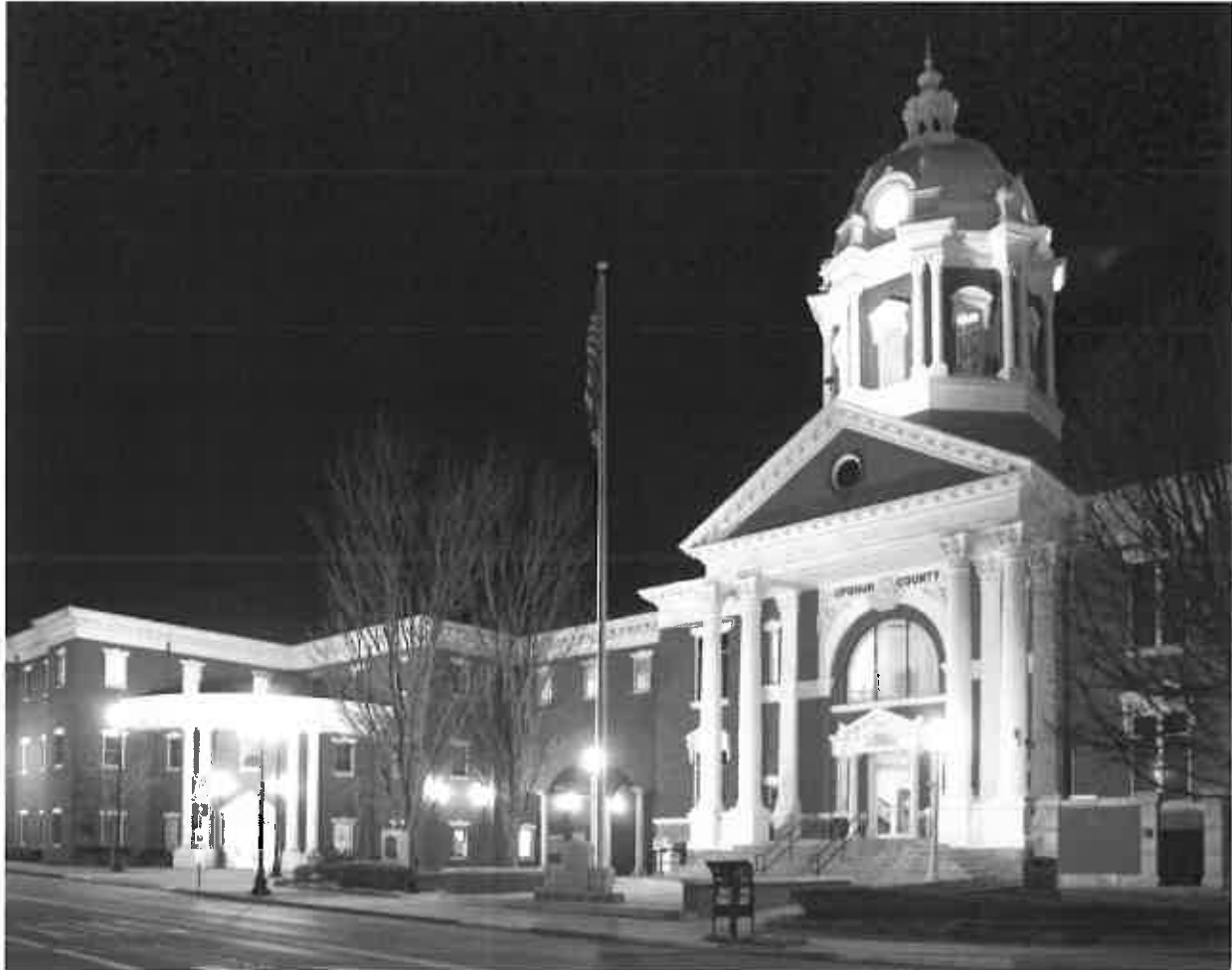
American Institute of Architects, Honor Award, 2008