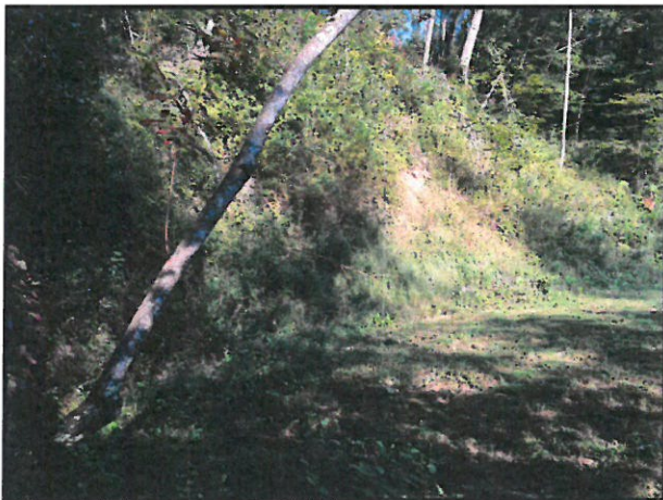
Highwall Bench with Collapsed Portals