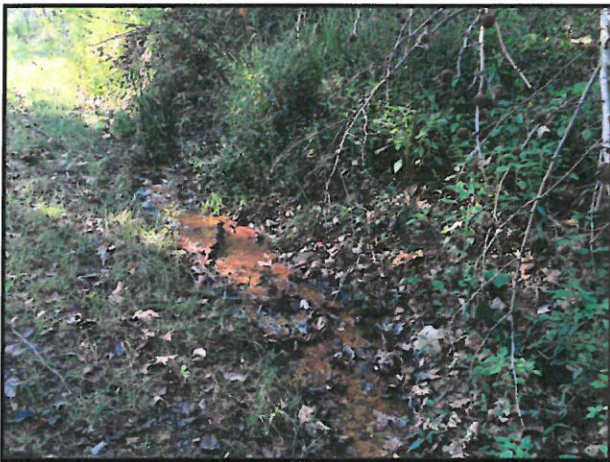
AMD From Collapsed Portal