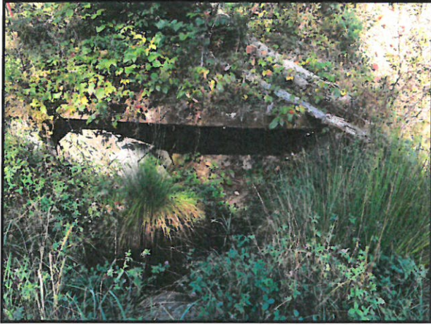
Open Portals Creating AMD