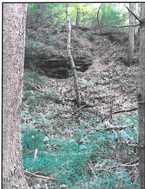
Open Dry Portal

Assist the WVDEP with requests for information, engineering during construction, and/or progress meetings as required or requested.