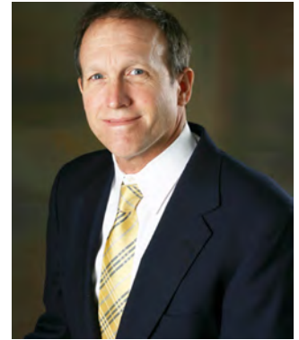
TERRADON VP - Survey and Mapping