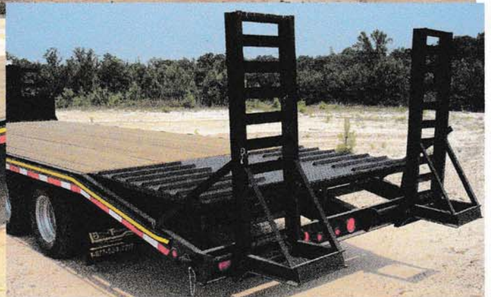
TRACTION CLEAT LEVER ACTON DOVETAIL (STANDARD IS WOOD)