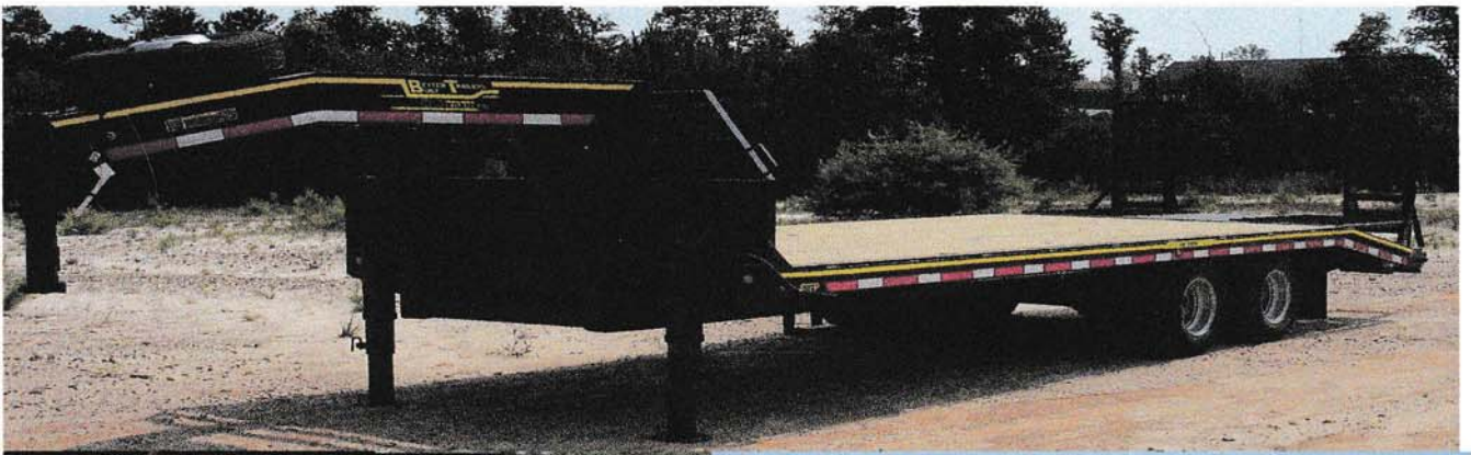
SPARE MOUNT - SPARE TIRE AND WHEEL AND BULK BOARD / GOOSENECK 2 5/16" COUPLER