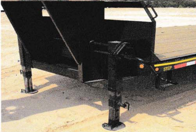
2 SPEED JACK WITH MATE AND SIDE STEP