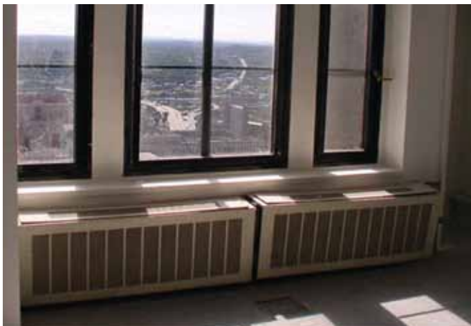
Before: Original induction units

Available for new and replacement installations. Powder coated durable sheet metal cabinet fit to suit the project. Adjustability is built into the cabinet design for variances found in the field. Step-by-step installation instruction manual for the contractor responsible for installation is included.