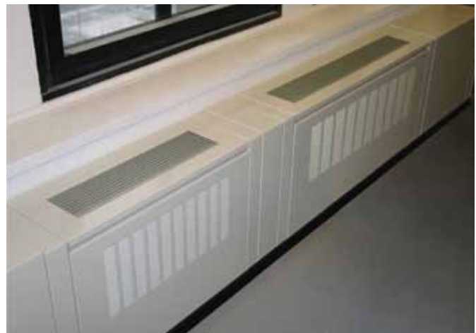
After: Replacement Rittling induction units

© Zehnder Rittling January 2012, English, subject to change without notice