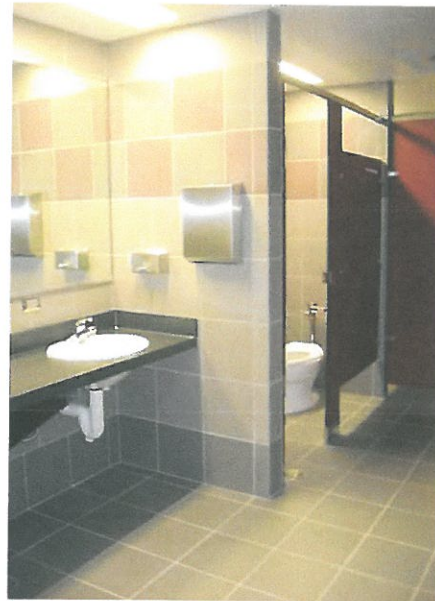
St. Albans Men's Room