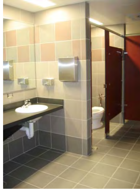
St. Albans Men's Room