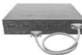
EPS-C2 Connected to a Summit X440