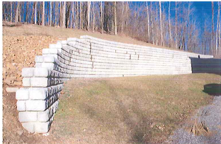
Reclamation Plan for Overfield (Lafferty)

flooded the residence's yard and basement. Also, an approximately 2 acre un-vegetated refuse pile adjacent to Elk Creek was a part of this project. Thrasher's scope and design for this project included the installation of a modified mine seal in the collapsed portal and re-grading the existing strip pit to drain positively offsite into a grouted riprap channel, thereby eliminating the flow of both mine water and storm water from reaching the residence. A 12' gravity retaining wall was designed to mitigate the existing landslide and diversion channels were designed above and below the proposed wall carry the water safely away from the residence. The un-vegetated refuse area was to be re-graded to drain positively and the material excavated to be from the strip pit and the retaining wall was used to cap (entomb) the refuse for re-vegetation.