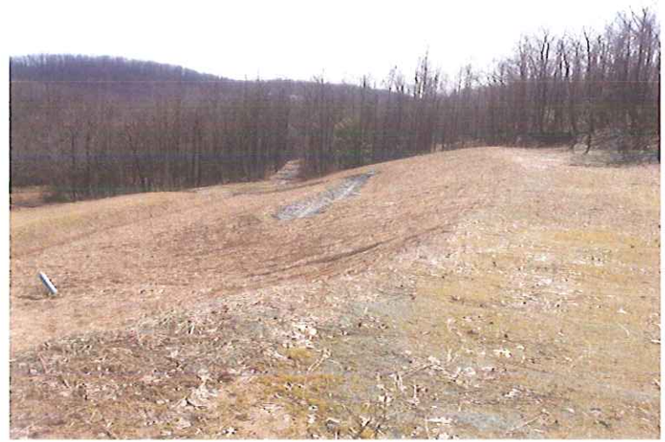
Design plans for Squires Creek Portals and Refuse Project

This project involved a significant mine discharge 300 feet upslope from a private residence. The water emanated from a strip pit located on the bench. The pit measured 20' wide, 40' long with depth unknown; it appeared that the pit was situated within old mine workings based on visible coal pillars near the pit outlet and there seemed to be a possible collapsed portal. Two natural drainages were observed entering the pit. Both of the drainages were completely dry, yet 50 gallons a minute was discharging from the pit. Due to the area being mined the natural drainage had been eliminated. The continual flow of water from the strip pit created a ditch that flowed off the hill through the private residence's yard and down to the county road. The hill behind the residence was constantly wet and minor sliding had already occurred. When it rained, the drainage ditch exceeded its carrying capacity and