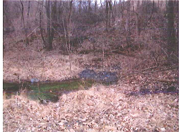
Pleasant Valley Site

Pleasant Valley (Brown) abandoned mine lands project has four (3) main sites which runs along a highwall bench parallel with the Monongalia River. These sites consists of mixed coal refuse sites with some vegetation, ± 4,800 linear feet of highwalls with an average height between 20 to 50 feet, water impoundments along/around highwalls and multiple open and collapsed portals. Of these portals, three have openings and will require bat gates. Some of the portals are producing acid mine discharge (AMD) and have pools of AMD at their entrances. Thrasher's preferred scope and design for this project included the installation of six (6) wet/modified mine seals in the existing collapsed and open mine portals, the installation four (4) bat gate mine seals, and entombing onsite (mixed) coal refuse. Approximately 48,000 cubic yards of material will be moved to backfill existing high walls, cover on-site coal refuse, and grade the project area. Storm water and portal conveyances have been designed to outlet at multiple locations along the highwall to better mimic the natural drainage of the site. This also prevents concentration of flows along the slope to help mitigate future soil erosion.