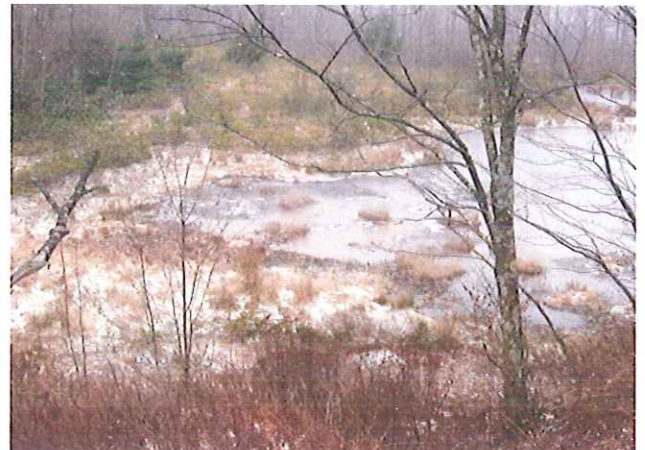
Roger Camp Hill Impoundment

Roger Camp Hill abandoned mine lands project has three (3) main refuse sites. Site 1 is a relatively small un-vegetated refuse pile along an existing access road. Site 2 consists of a one-half (1/2) acre impoundment located in the middle of a one (1) acre refuse area, partially vegetated strip spoil, and acid mine drainage (AMD). Most of the refuse is completely un-vegetated, as well as toxic, and leaches into the pond, which has a pH of 2.6. The pond has a maximum depth of three (3) feet with a volume of approximately 169,000 gallons. About 700 feet to the west of the refuse area, there is an AMD seep location at the toe of the old spoil outslope. Field measurements of the seepage indicated a pH of 3.3 Fe > 10 mg/l; the flow was estimated at 15 gpm. Site 3 consists of a one-half (1/2) acre refuse pile that is primarily un-vegetated with deep rills. Thrasher's preferred scope and design for this project included dewatering the impoundment, bury or entomb all onsite coal refuse (spoil). Approximately 8,250 cubic yards of material will be moved to backfill the impoundment, cover on-site coal refuse, and grade the project area to drain positive toward proposed vegetated conveyances.