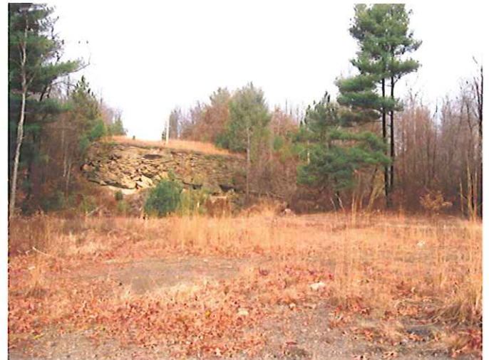
Laurel Run Highwall