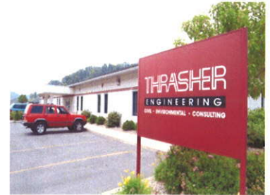
Thrasher Engineering, Inc. Office – Clarksburg, WV

Offices 30 Columbia Boulevard, Clarksburg, WV 300 Association Drive, Charleston, WV 3000 Thayer Center, Oakland, MD 380 Airport Circle, Beckley, WV – Lab & Field Office Princeton, WV – Pentree, Incorporated – Affiliate