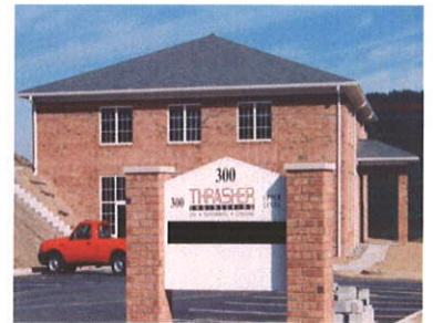
Thrasher Environmental, Inc. Office – Charleston, WV