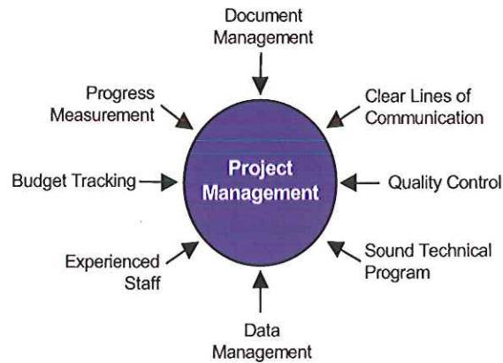
Elements of successful project management.

To ensure the proper application of specialized engineering expertise for all clients, the firm makes use of its quality management procedures that includes creating a Technical Advisory Group. The quality management procedures provide for the preliminary and final review of all concepts, contract plans, layouts, and project reports, and provide for the issuing of internal memoranda which concern developing technologies. These procedures provide for the most up-to-date technical information from inside and outside the firm, and the maintenance of technical files for new products, processes, and construction techniques. In addition, these procedures provide for the involvement of specialists, as needed, to participate in the review of extraordinary or particularly challenging projects.