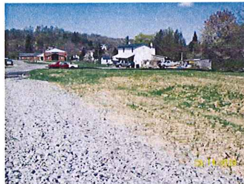
Site 1 – Church

The Construction Cost was approximately $228,500.