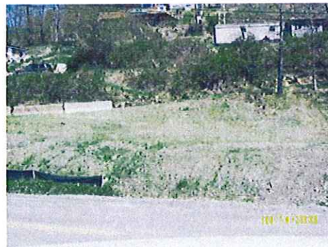
Site 2 – Highway