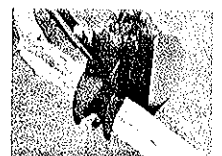
Optional mechanical thumb

20 lbs Less on Digging + Dipperstick Force