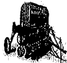
5000 Series Drill