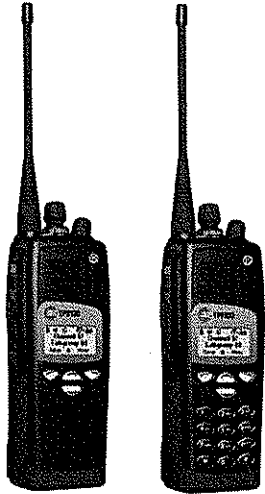
Models shown IS TP9155 and IS TP9160