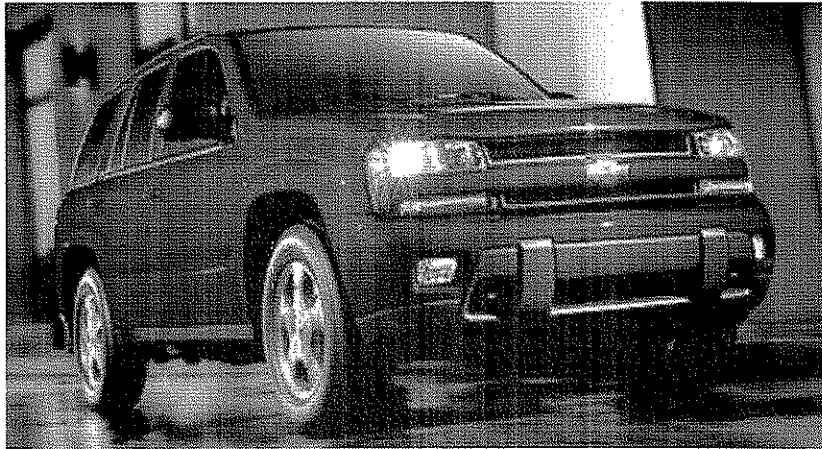
Photo may not represent exact vehicle or selected equipment.