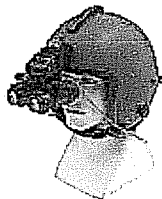
AN/AVS-9 with HGU-84P Helmet