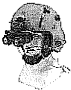
AN/AVS-9 with SPH-5CG Helmet