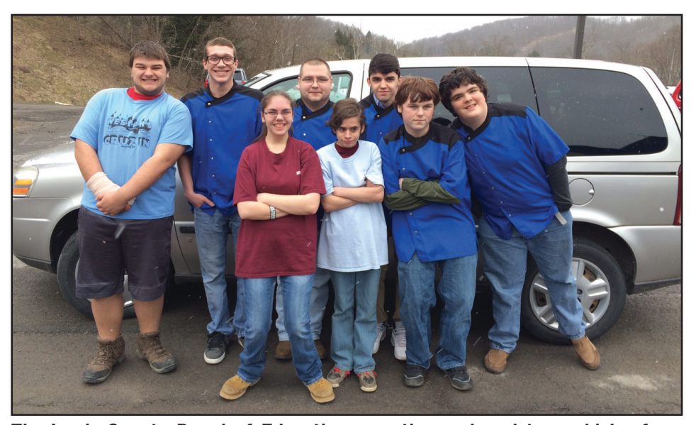
The Lewis County Board of Education recently purchased two vehicles from WVSASP. These vehicles will serve a special purpose—transporting students in Lewis County to enrichment activities, including after-school jobs, volunteering, activities and sportings events in which they partipate.

When items no longer needed by West Virginia state agencies are sent to the West Virginia State Agency for Surplus Property (WVSASP), the goal is for eligible organizations and the public to purchase needed items at an affordable price. WVSASP staff takes great satisfaction in knowing these items will have a second life and be utilized to their fullest potential.