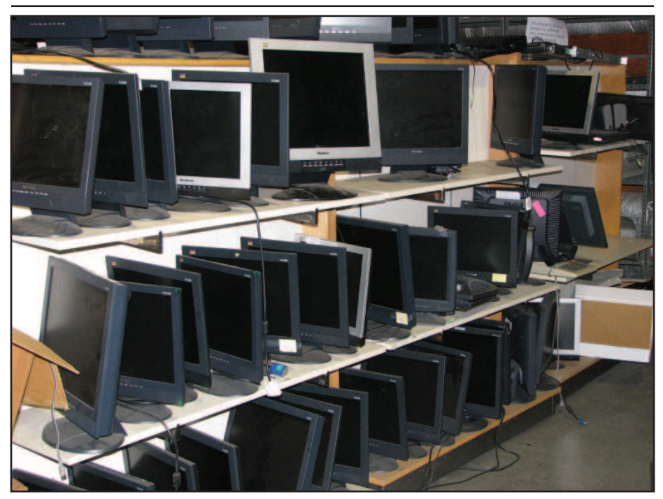
Shelving has been added to the warehouses to make the environment look more professional and make viewing the items a much easier process for customers.