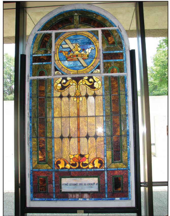
A stained glass window from the State Industrial School for Boys in Pruntytown was obtained by the WVSASP for the state museum.