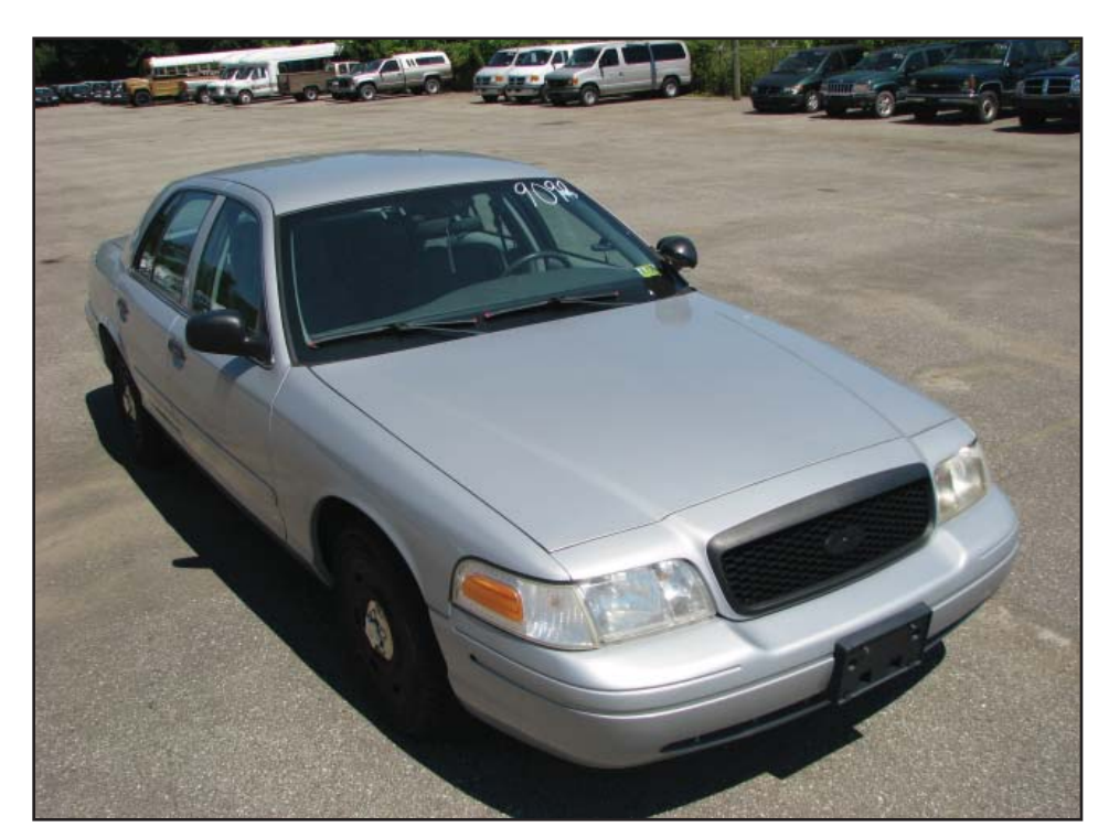
The West Virginia State Agency for Surplus Property stocks a variety of retired state vehicles which often find new homes as vehicles for use by municipalities throughout the state.

"We knew that we could not buy a vehicle new, and certainly not as