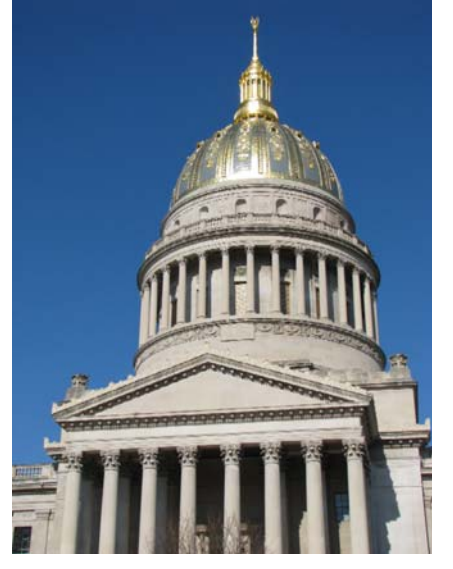
The West Virginia Legislature passed House Bill 4664 during the 2008 Regular Session, which changes the way the State Agency for Surplus Property can sell items to the general public.

"We have had in years past people from out of town stop by because they heard about us and wanted to see what we had. When they learned they could not purchase an item during their visit, they would leave discouraged because it was not worth their while to place a sealed bid on an item and then have to make a