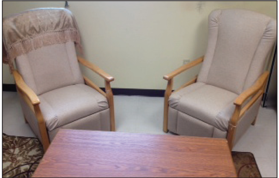
The Kanawha Institute for Social Research and Action (KISRA) has utilized the West Virginia State Agency for Surplus Property for everything from computers to office equipment.