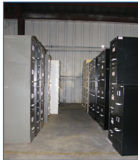
The West Virginia State Agency for Surplus Property is undergoing a series of changes, including reorganizing the warehouse and general cleaning throughout the facility. Pictured are filing cabinets now available to eligible organizations.