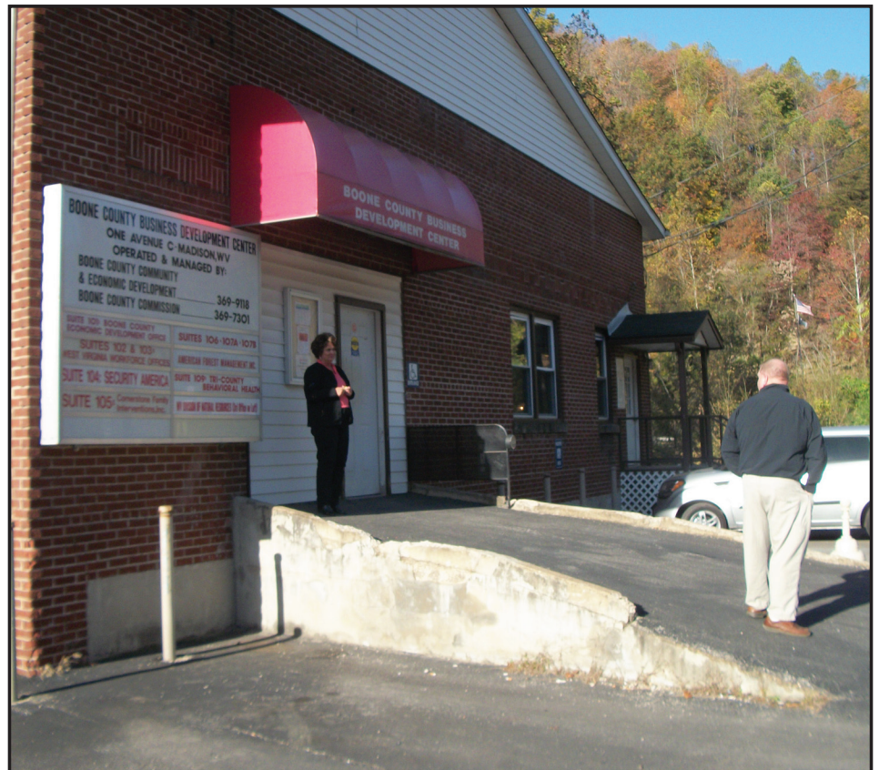
The state Division of Juvenile Services has worked extensively with the West Virginia State Agency for Surplus Property in securing furniture for its Youth Reporting Centers throughout the state. The division is opening an average of three centers per year.