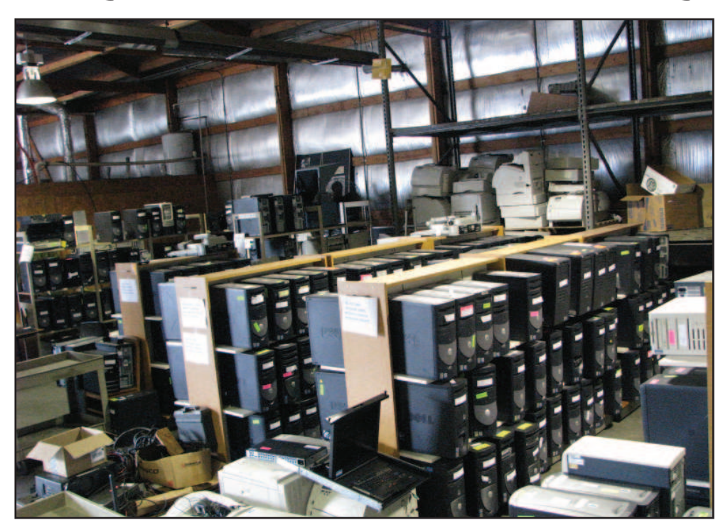
Rows of desktop computers are ready for sale at the West Virginia State Agency for Surplus Property warehouse in Dunbar. At any given time, there are more than 300 computers in stock with most costing less than $150 for a computer, monitor, mouse and keyboard.

"When desktop computers are turned in to us from state agencies, if they have Window XP on it, we have a technician here who wipes it clean with special software and then re-installs basic Windows XP. If a computer is