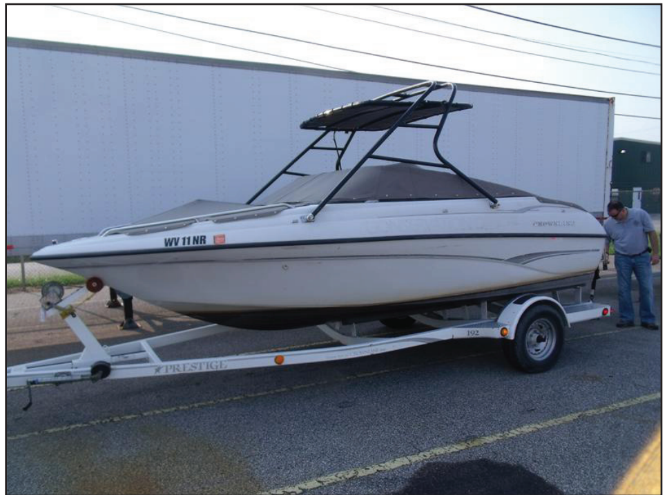
A boat previously used by the Division of Natural Resources was recently purchased by Cabell County Emergency Medical Services. The boat will be used to fill service and rescue needs on the Ohio River not met by the organization’s current fleet.

“The applications are endless for using this boat,” he said. “We do a lot on the Ohio River with rescue and assistance, jet ski and boat races, so we have