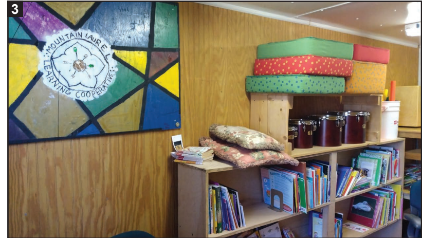
After 15 years in a field within Canaan Valley as a research site (Photo 1), a shipping container has found new life as a new source of education. The Mountain Laurel Learning Cooperative (MLLC) secured the donation of this federal property through WV Surplus and coordinated with a local business for the transportation of the 30 foot shipping container to its new home in Thomas, WV (Photo 2). The staff at MLLC were able to turn the shipping container into a library pod for its child care center (Photo 3).

To learn more about the federal property program, visit https://administration.wv.gov/surplus/program/FederalPrograms . Additional information on programs offered by WV Surplus is available at WVSurplus.gov .