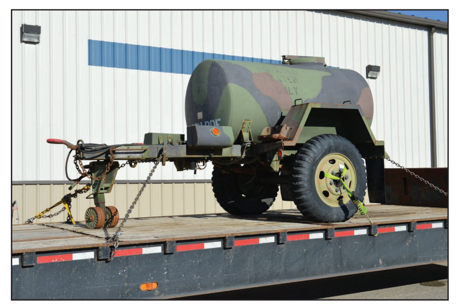
Three trailer mounted water buffalo tanks were acquired by Randolph County through the Federal Surplus Property Program. These items were transported from outside states to the WV Surplus warehouse in Dunbar before being transported to Randolph County.

To learn more about the federal property program, visit WVSurplus.gov or call 304-766-2626.