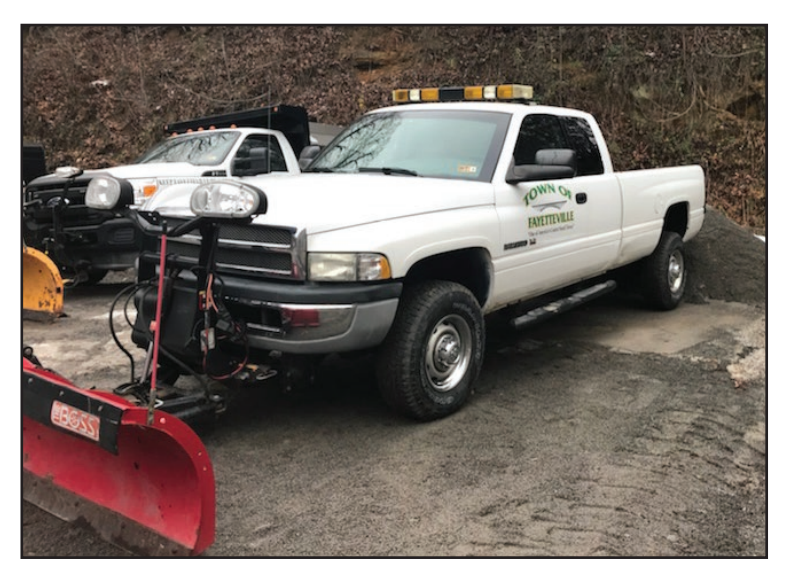
Using trucks purchased at WV Surplus, the Town of Fayetteville was able to add additional snow plows to its fleet.