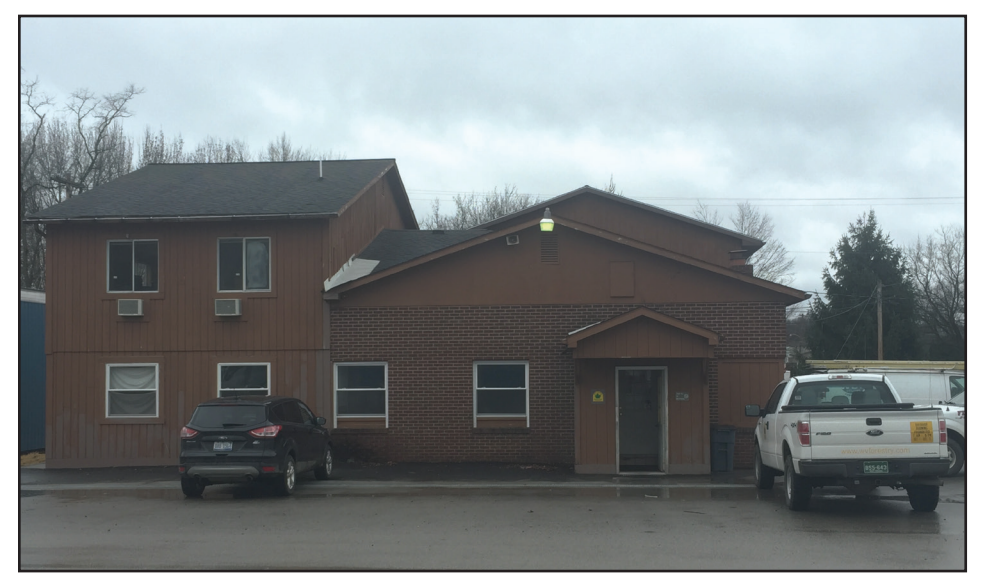
The Division of Forestry's Buckhannon field office (above) utilized weekly surplus deals to furnish its conference room (below) for less than $100. Margaret Ingram, procurement officer for the Division of Forestry, noted that Surplus Property is a great option for organizations working on a tight budget.