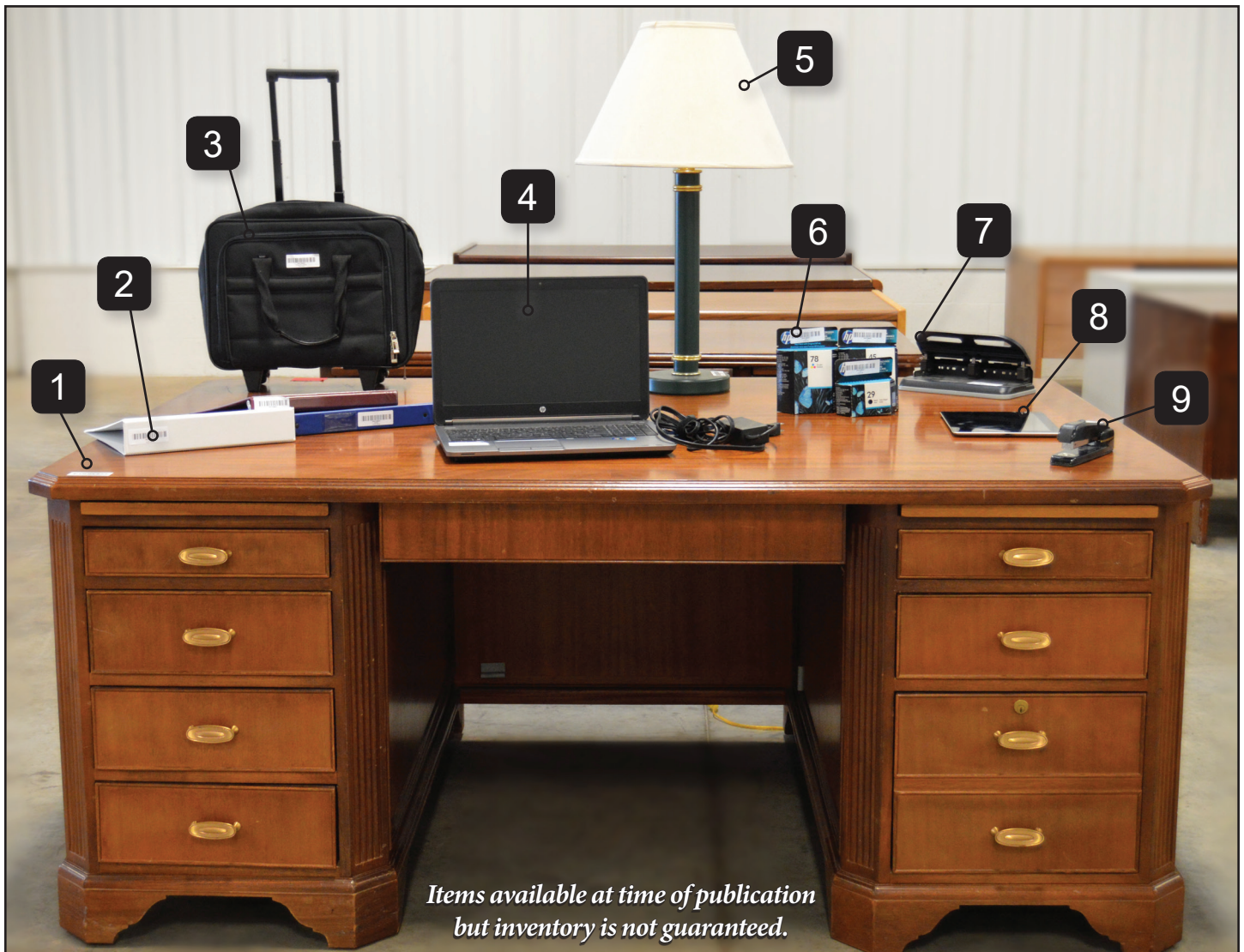
Items available at time of publication but inventory is not guaranteed.

If this classic stapler is not your style, WV Surplus has electric staplers too.