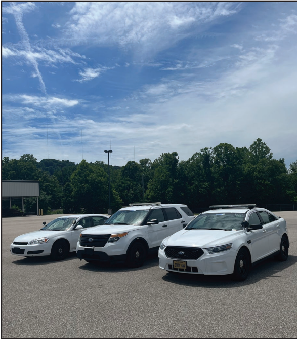
WV Surplus recently secured the acquisition of two cars and an SUV that were formerly federal law enforcement vehicles.