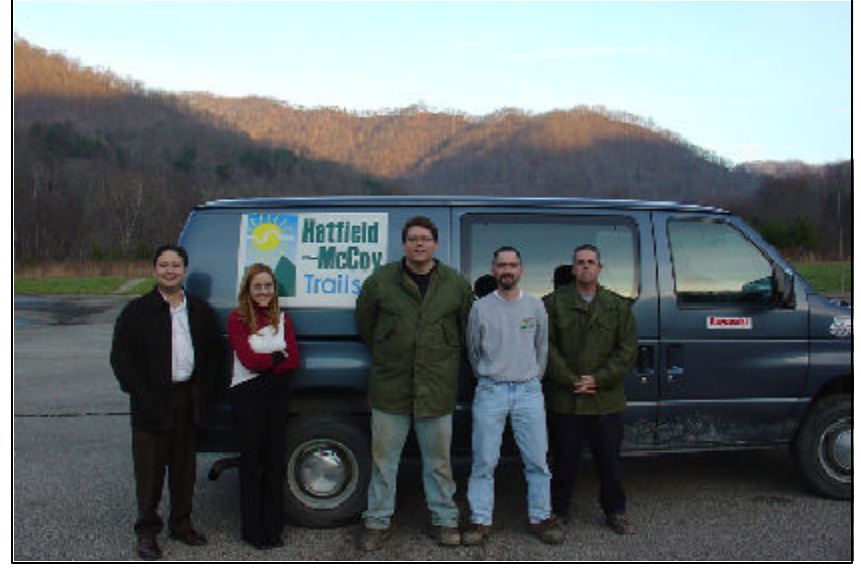
Offering Outdoor's Excitement

"The whole principle behind the program is that it is <u>surplus</u> – things