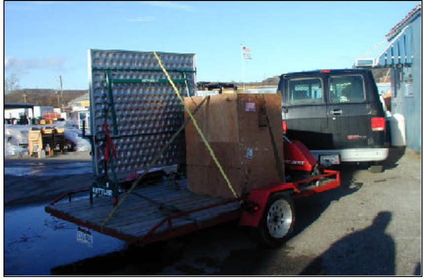
Loaded and Ready to Go

Please note that a listing of state vehicles available are posted and updated weekly on the Surplus Property's website at www.state. wv.us/admin/purchase/travel.