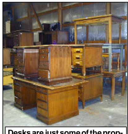
Desks are just some of the property available by sealed bid.

Aside from the 'usual' items, Frye said Surplus Property occasionally recieves those