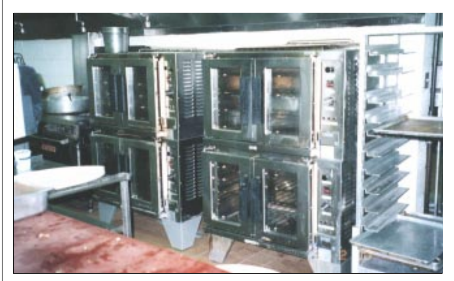
These stainless steel convection ovens are used by the State Capitol Cafeteria, located in the basement of the Capitol Building. The ovens are used daily to make fresh rolls.

Prozzillo explains that WVSASP has a wide variety of property that eligible organizations can acquire. "Surplus Property has many things available in its federal and state surplus programs which my agency has enjoyed. We plan to continue to purchase from WVSASP."