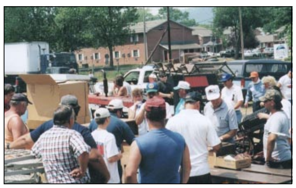
Surplus Property Takes its Auction on the Road

Frye indicated that the benefits in traveling to Romney to conduct an auction were two-fold. "By taking our auction to Hampshire County, we were able to assist state agen-