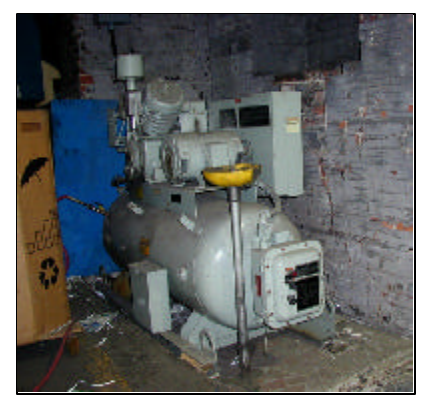
This surplus compressor is used to clean the equipment at the Kanawha County Solid Waste Authority.

dependable for those long trips. On the other hand, a small community can possibly take that same vehicle and use it for local use. The same concept can be used for office equipment and computers, he said.