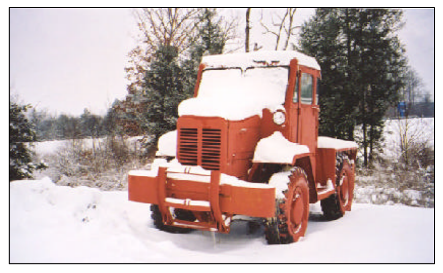
All equipment the city of Summersville has purchased from Surplus Property, such as this 4-wheel drive aircraft tug ( picturedabove ) and the 1986 Jeep Cherokee ( pictured to the right ), is put into service immediately.