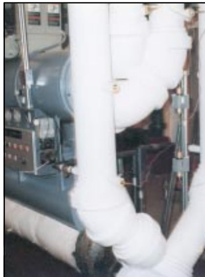
A Closer Look... The surplus chiller unit proved to be a great asset to the Charleston Area Medical Center.