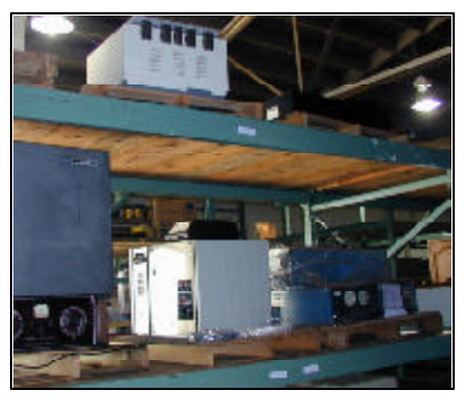
The Black Knight Trading Company's storage capacity increased by using surplus shelving.

In addition to the great bargains at Surplus Property, Mills stresses about the helpfulness of the staff, who he describes as just 'good people'. "Once we bought as