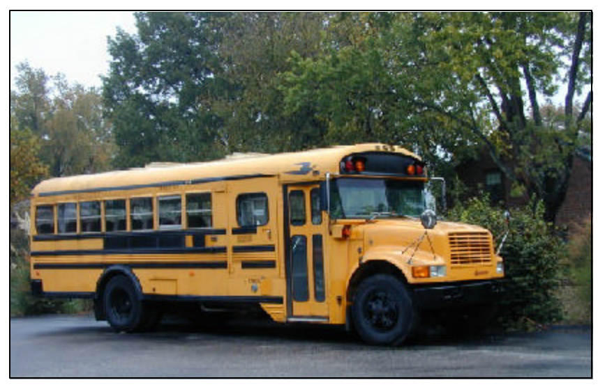
Prior to purchasing these buses, the University of Charleston only had an eight-passenger van to accommodate their transportation needs.