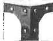
CORNER BRACKETS HELP PREVENT ROCKING AND IMPROVE STABILITY.