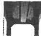
HAT CHANNEL INCREASES OVERALL STRENGTH. HELPS PREVENT BOWING AND DEFLECTION DUE TO OVERLOADING.