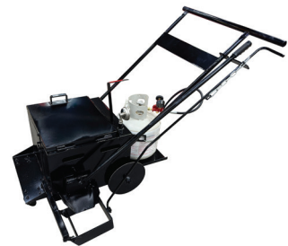
ME Bander Applicator