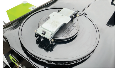
Standard 20" Manhole with Vented Quick Open Center