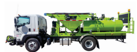
P5 One-Person Patcher with DuraPatcher Technology™