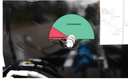
Standard Easy to Read Tank Contents Gauge