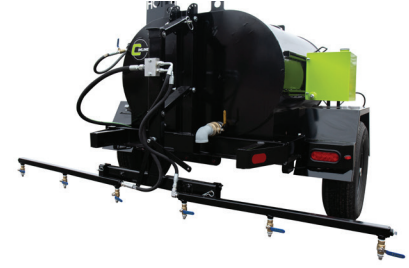
Optional Spray Bar with Transport Stowage