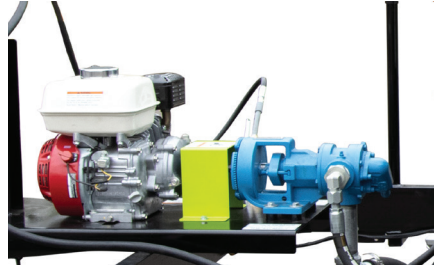
Standard HONDA Engine and Asphalt Pump with Recirculation