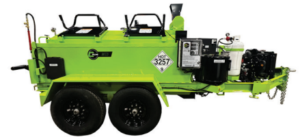
ME-Series™ Mastic Melter Applicator 60 / 250 / 350 Gallon Units Available