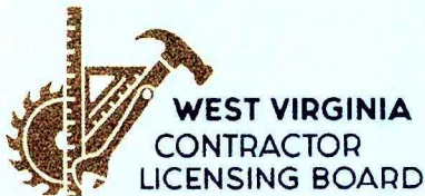
Chair, West Virginia Contractor Licensing Board

A copy of this license must be readily available for inspection by the Board on every job site where contracting work is being performed. This license number must appear in all advertisements, on all bid submissions, and on all fully executed and binding contracts. This license is non-transferable. This license is being issued under the provisions of West Virginia Code, Chapter 30, Article 42.