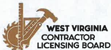
Chair, West Virginia Contractor Licensing Board

A copy of this license must be readily available for inspection by the Board on every job site where contracting work is being performed. This license number must appear in all advertisements, on all bid submissions, and on all fully executed and binding contracts. This license is non-transferable. This license is being issued under the provisions of West Virginia Code, Chapter 30, Article 42.